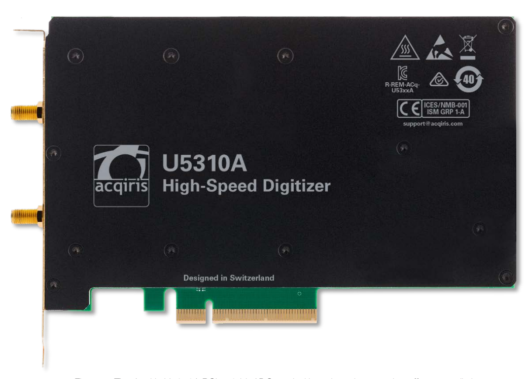
Figure 4. The Acqiris U5310A PCle 10-bit ADC card with on-board processing offers a small size for easy integration.